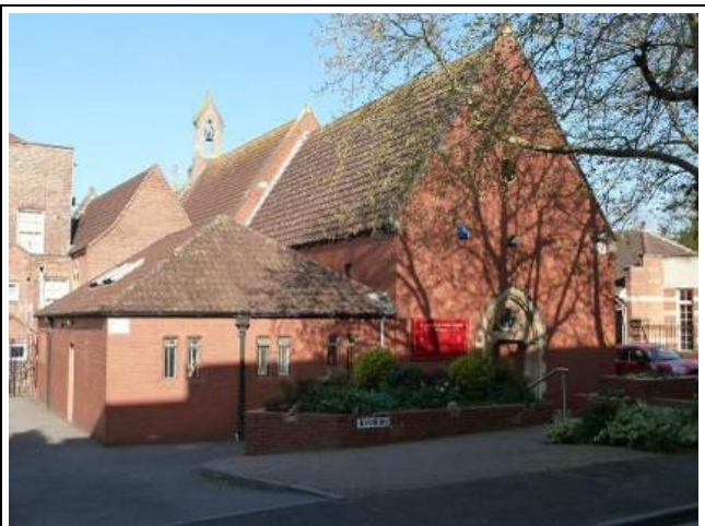
2) The 1981 extension