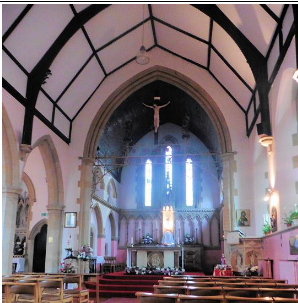
3) General view of the Nave