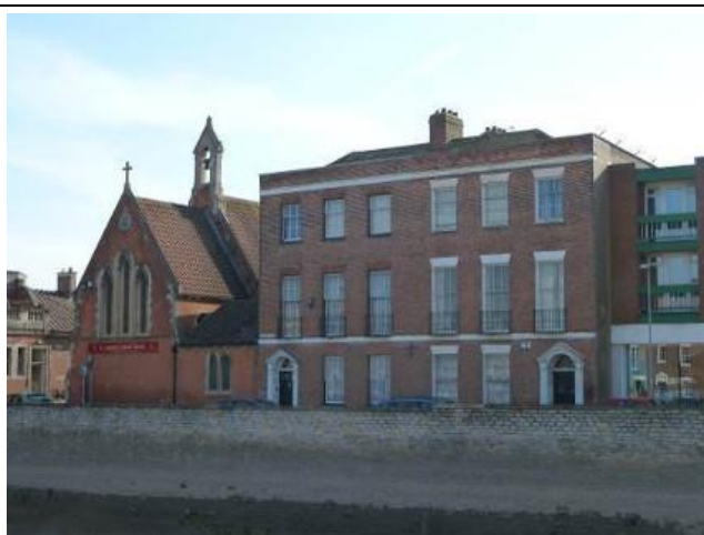
1) St Joseph's and the Presbytry

The Co-operative building next to the church was purchased in 1979 for £20,000 for demolition to provide space for the extension of the church. Demolition started in October 1980. Building began in May 1981, and the new extension was used for the first time at Christmas Midnight Mass, 1981. A new altar was installed in 1981 when it was brought forward at the time of the construction of the extension to the Nave