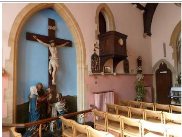
4) The Chapel